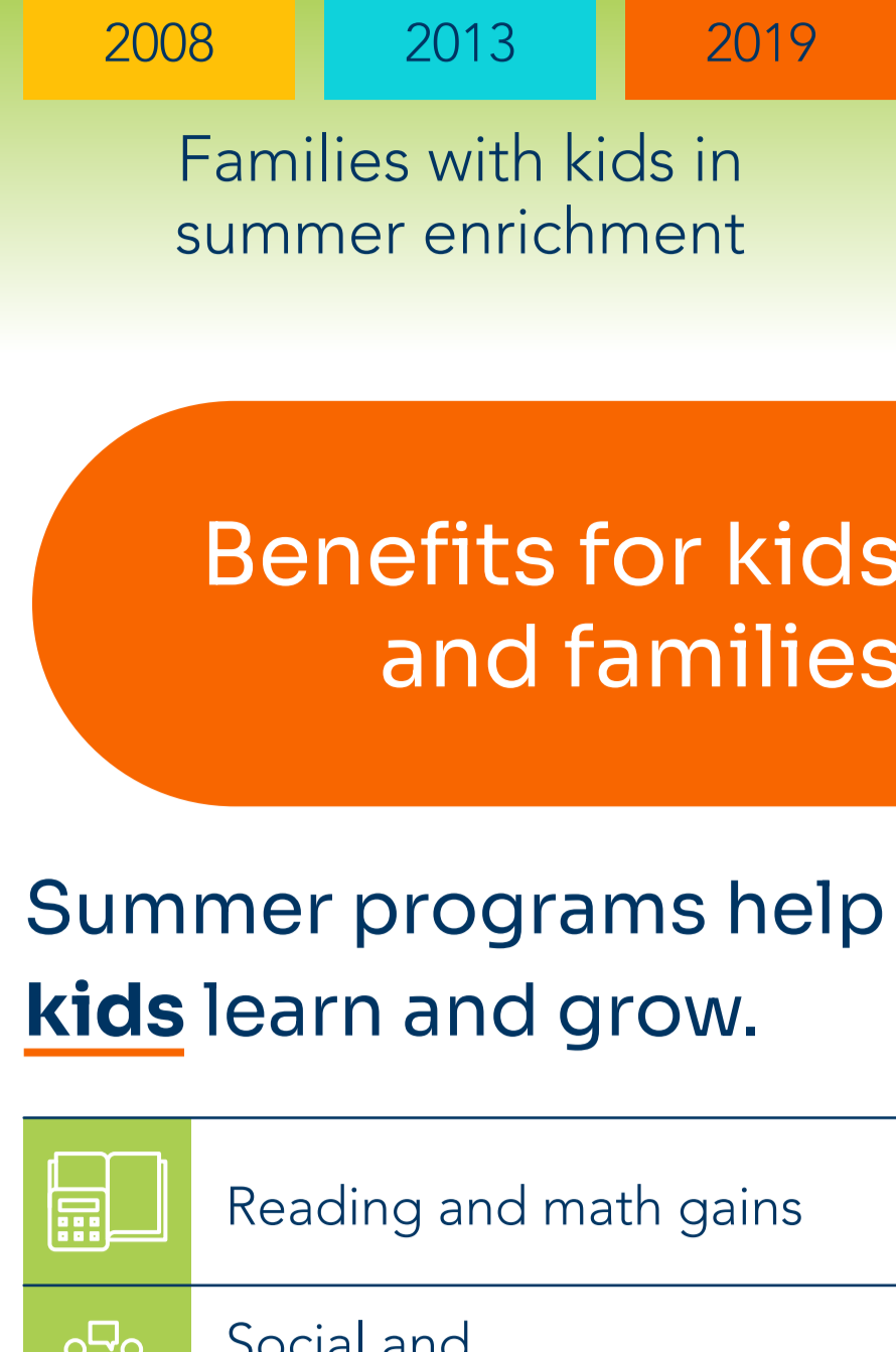
Families with kids in summer enrichment